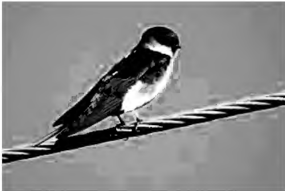
Red-rumped Swallow Hirundo daurica They breed here in large numbers, make their nest with sand and dust; spend most of their time flying, an estimated 90% of their time in the air.

Today after so many years, I feel that if I had not missed the chance to visit Hingolghadh as a schoolboy, I could have enjoyed the untouched beauty of the place better. With this photofeature, I would like to give you a glimpse of the winged beauties that Hingolghadh harbours.